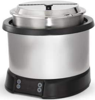
Mirage® Induction Rethermalizer