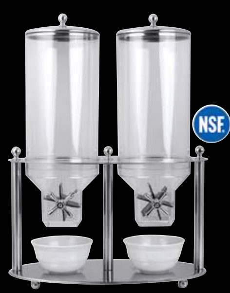
2531-2 Double Dispenser