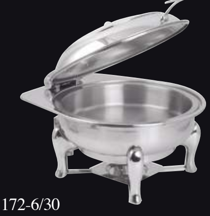
Stand For Mini-Reflection Round Server

2173-6/12 Mini-Reflection Buffet Server, Square 16-3/4" L 15" W 5 Ouart Additional Insert Item #522-66/12