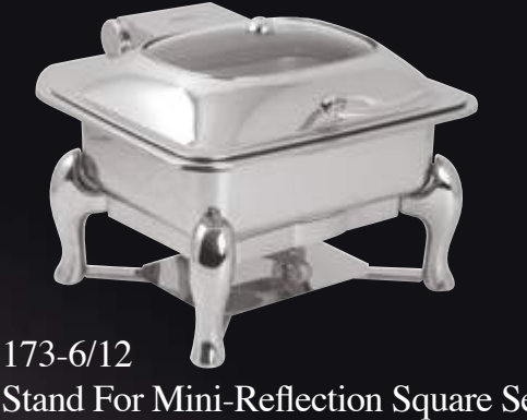
Stand For Mini-Reflection Square Server