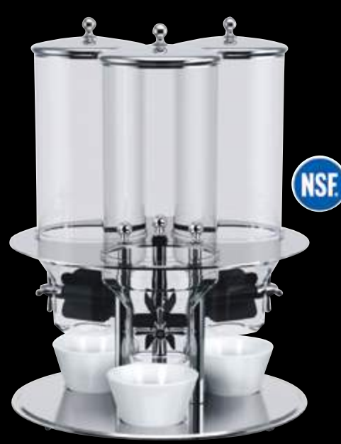
2531-3 Triple Dispenser