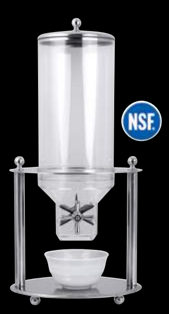
2531 Single Dispenser

A new addition to our Champions of Breakfast Line-up! Each Acrylic cylinder has a 10-liter capacity. Choose from our single, double or triple dispenser. The triple unit has a rotating chassis for easy dispensing.