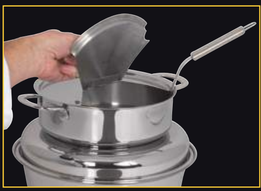
Patented Hinged Cover!